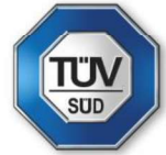
Table 2: Devices covered by this letter and for which the TÜV SÜD Product Service GmbH is NOT responsible for appropriate surveillance of the corresponding devices under the applicable Directive: